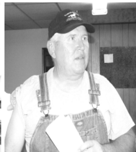
Granite City, Illinois