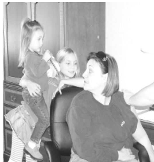
St. Louis, Missouri