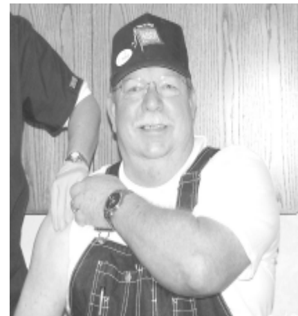
Kansas City, Missouri